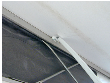
FIT POLE END INTO WALL BRACKET FIXED TO SIDE OF VAN