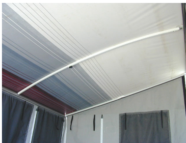
FITTED IN CONJUNCTION WITH ANTI FLAP KIT AND WALLS