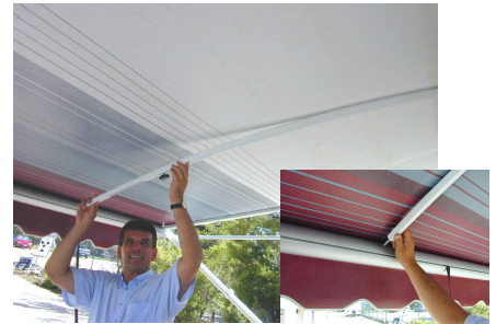
EXTEND OUT FRONT TELESCOPIC SECTION AND FIT SPIGOT INTO HOLE IN ROLLER