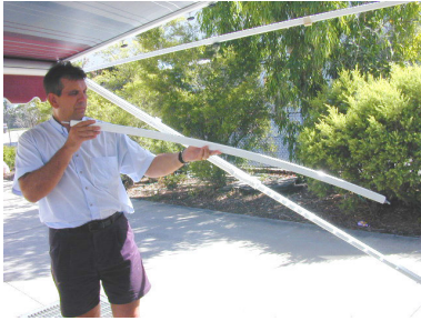
RAFTER RETRACTED FOR TRAVEL

The Curved Roof Rafter is particularly effective when used in conjunction with our Anti Flap Kit, with or without the addition of walls.