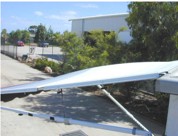
SHOWS CURVED ROOF RAFTER IN POSITION